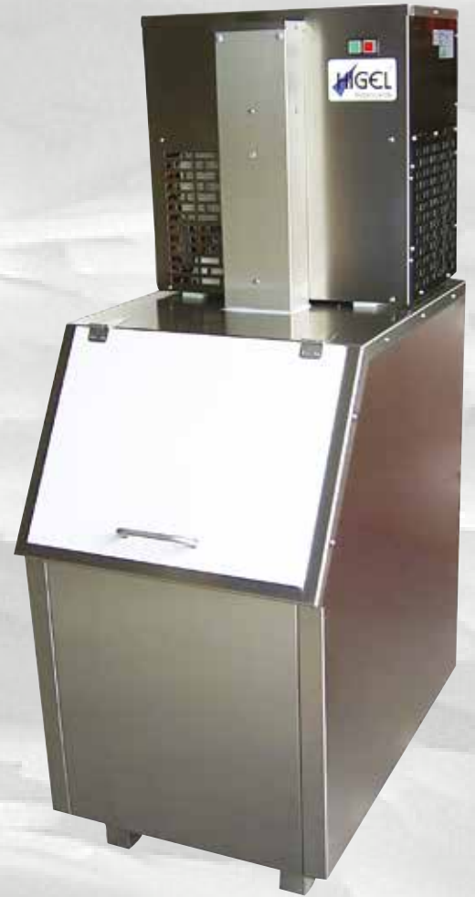
HEC 120 EB1

Available for example in the following versions: