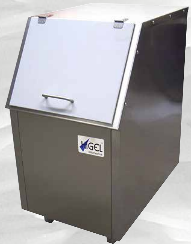
Ice storage container EB1