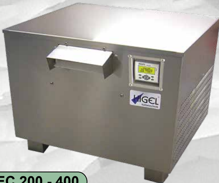
HEC 200 - 400