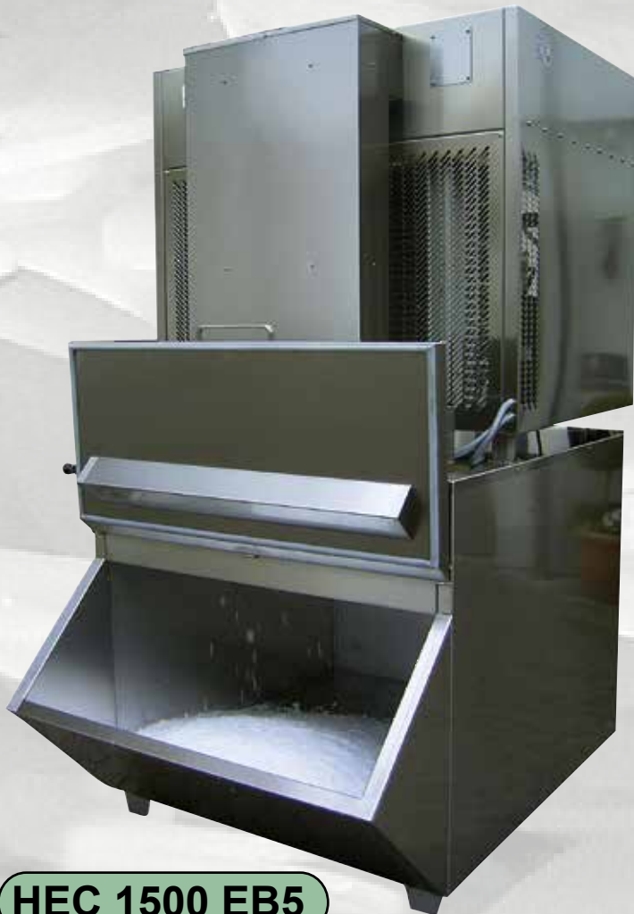
HEC 1500 EB5