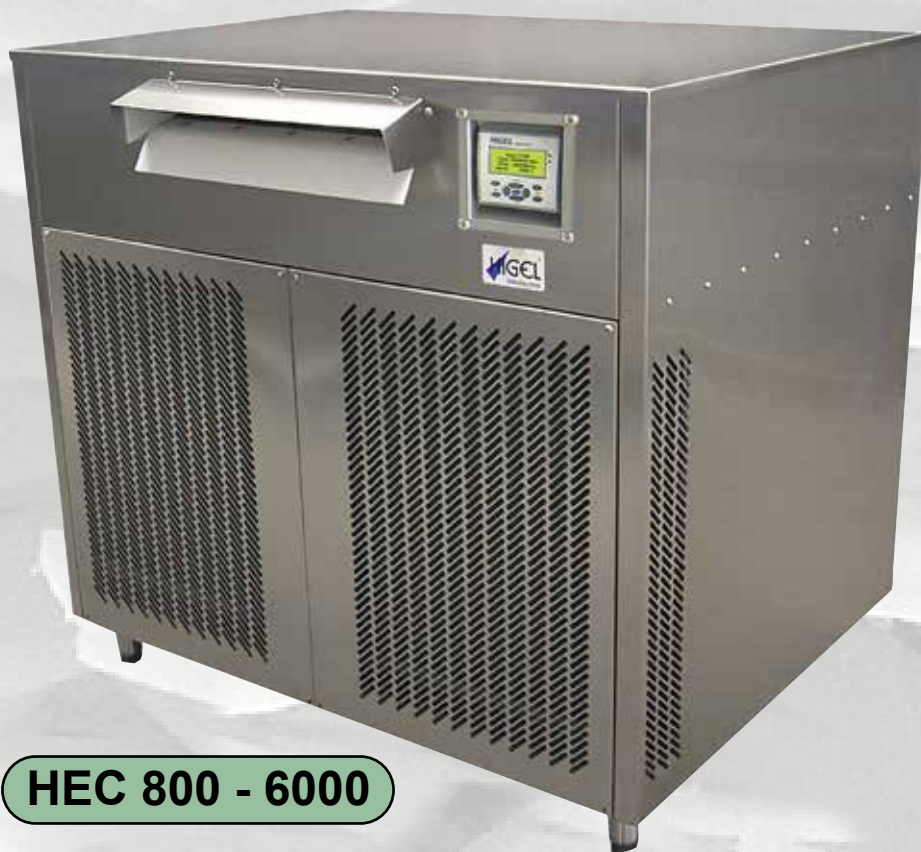
HEC 800 - 6000